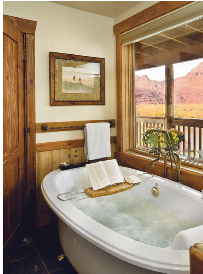
THIS PAGE: Sorrel River Ranch Resort and Spa features spacious and comfy studios; standing on the banks of Oak Creek, L'Auberge de Sedona boasts a beautiful location perfect for nature lovers and outdoor enthusiasts. OPPOSITE PAGE: The wild is at your fingertips at Sorrel River Ranch Resort and Spa

People come from all over the world to visit Utah's staggering parks. The smallest of Utah's Mighty 5, Arches National Park is hard to beat. With over 2,000 stone arches, one that stands out is Delicate Arch, the largest free-standing arch in the park which is also the most visited. A three-mile hike which climbs 146m and passes a wall of Ute Indian petroglyphs to see Delicate Arch up close and personal is all but essential.