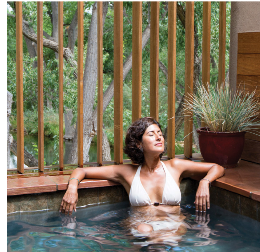
THIS PAGE: Inn and Spa at Loretto's design stays true to the spirit of Santa Fe (top); Sunrise Springs Spa Resort's isolated location and wide range of treatments and experiences means you won't need to leave for days at a time (bottom). OPPOSITE PAGE: A plush guest suite at Inn and Spa at Loretto, famed for its traditional adobe architecture